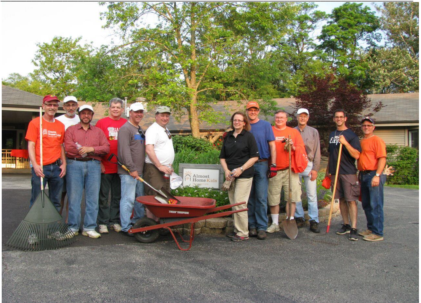
Almost Home Kids Mulch & Clean Up